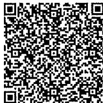
SLT Pre-School referral form

Please complete an online referral form via our website at: https://mkslt-preschoolreferral.co.uk